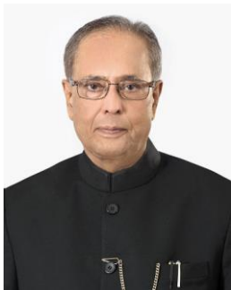
President of India Shri Pranab Mukherjee (From 25 July 2012)

As per the Central Universities Act 2009, the President of India is the Visitor of the University.